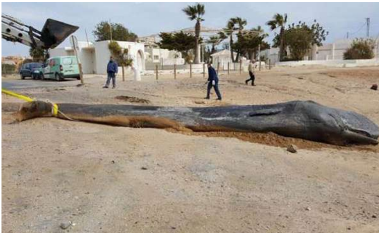
Bottom left: Sperm whale stranded on Spanish shore, 2018