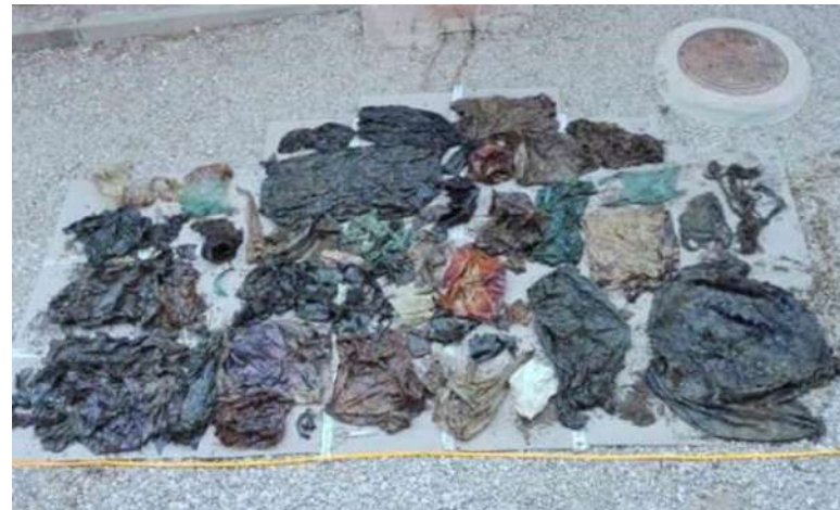
Bottom right: Plastic retrieved from stomach of dead sperm whale, 2018