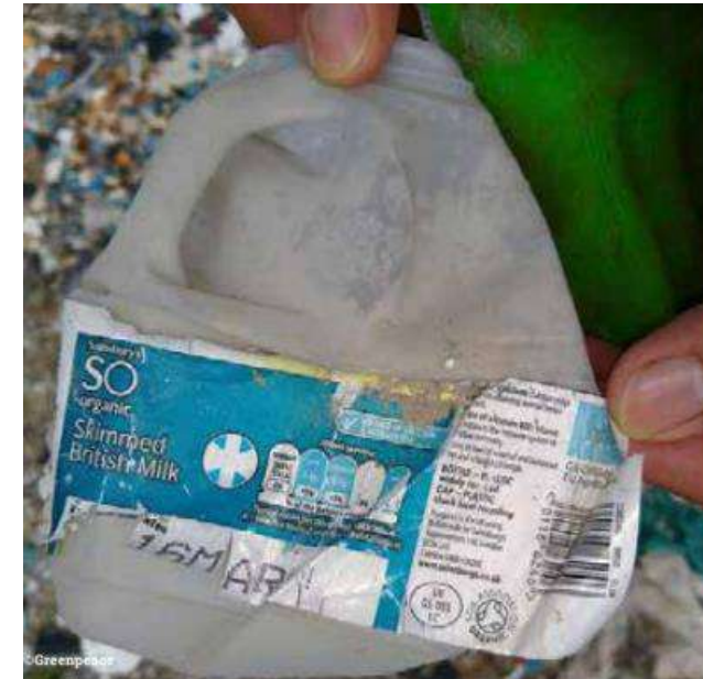
Above: UK plastic in Malaysia